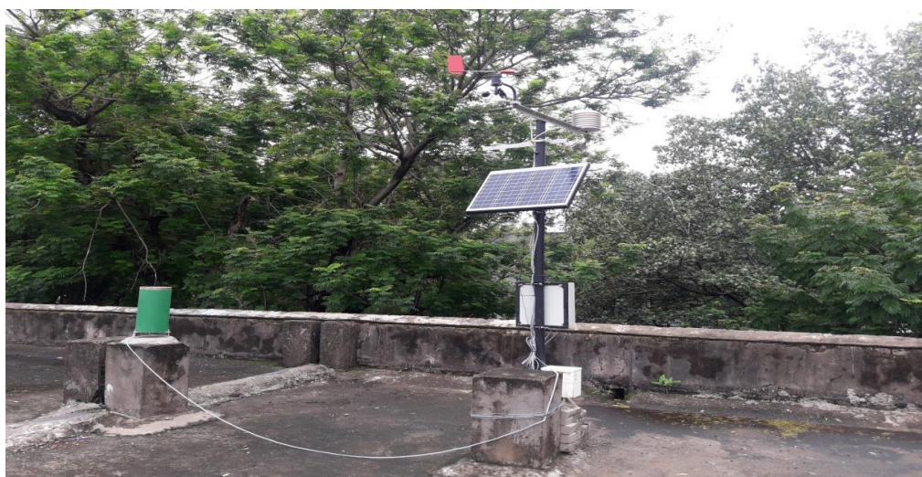
Weather Monitoring System