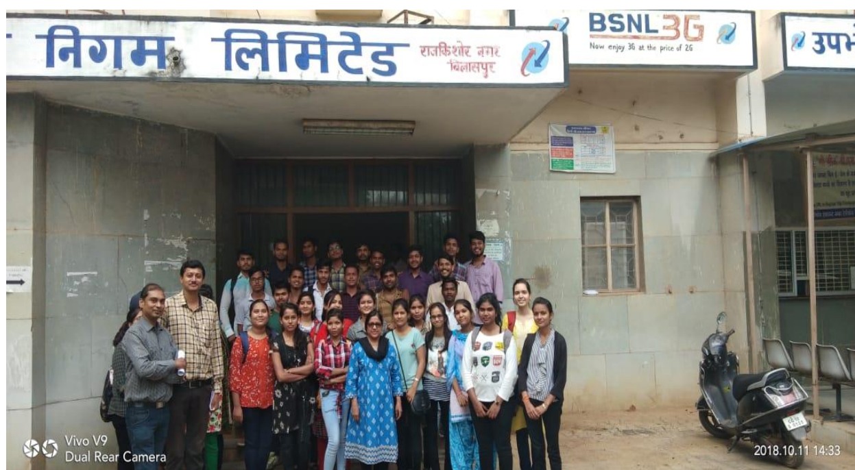
Educational visit of VII sem. ET&T students