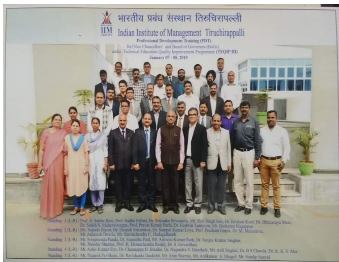
Professional Development Training Programme, IIM Trichi