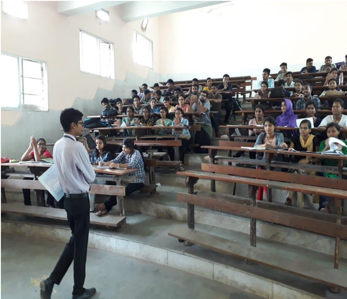
Employability & soft skills training to 5th sem..Students