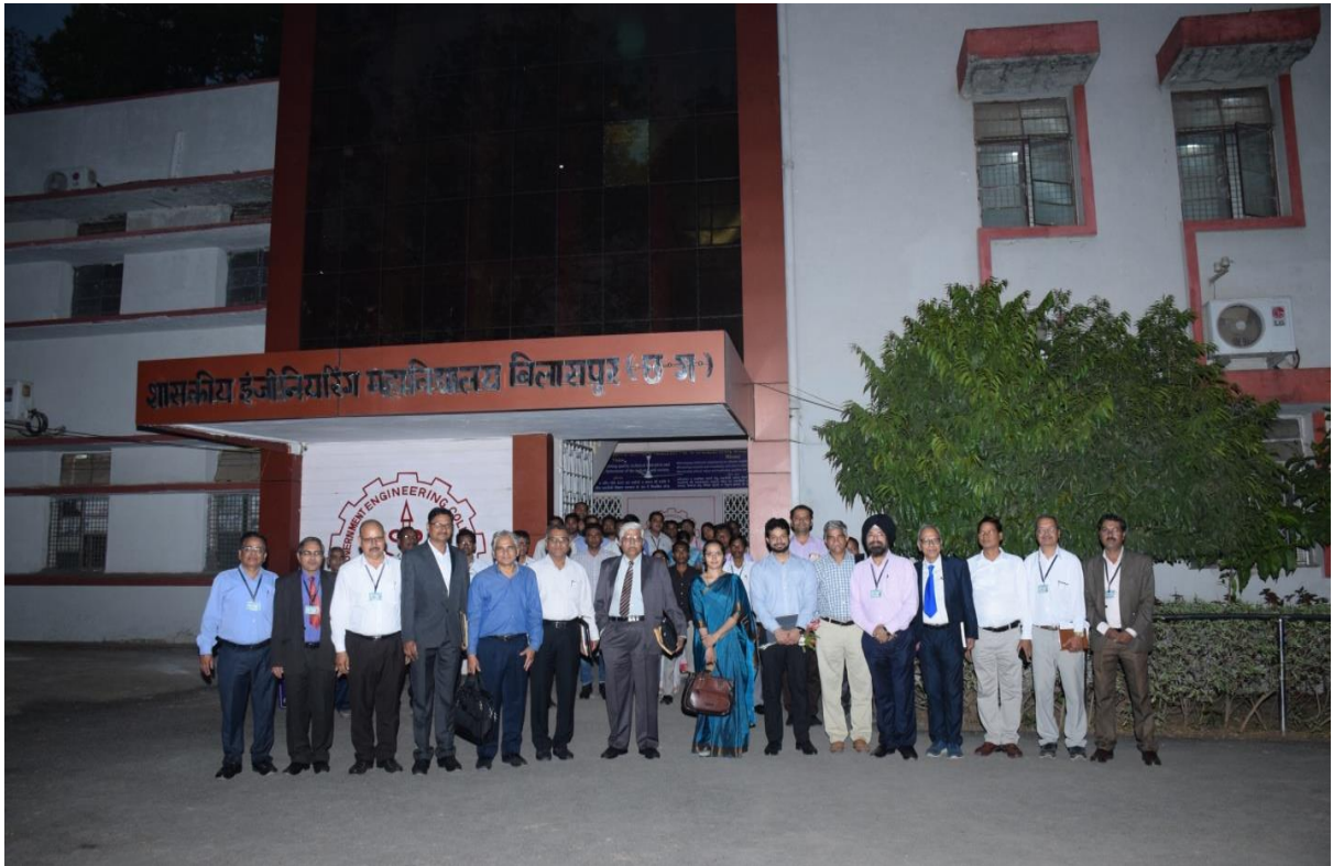
Principal Secretary, Technical Education, with NBA team