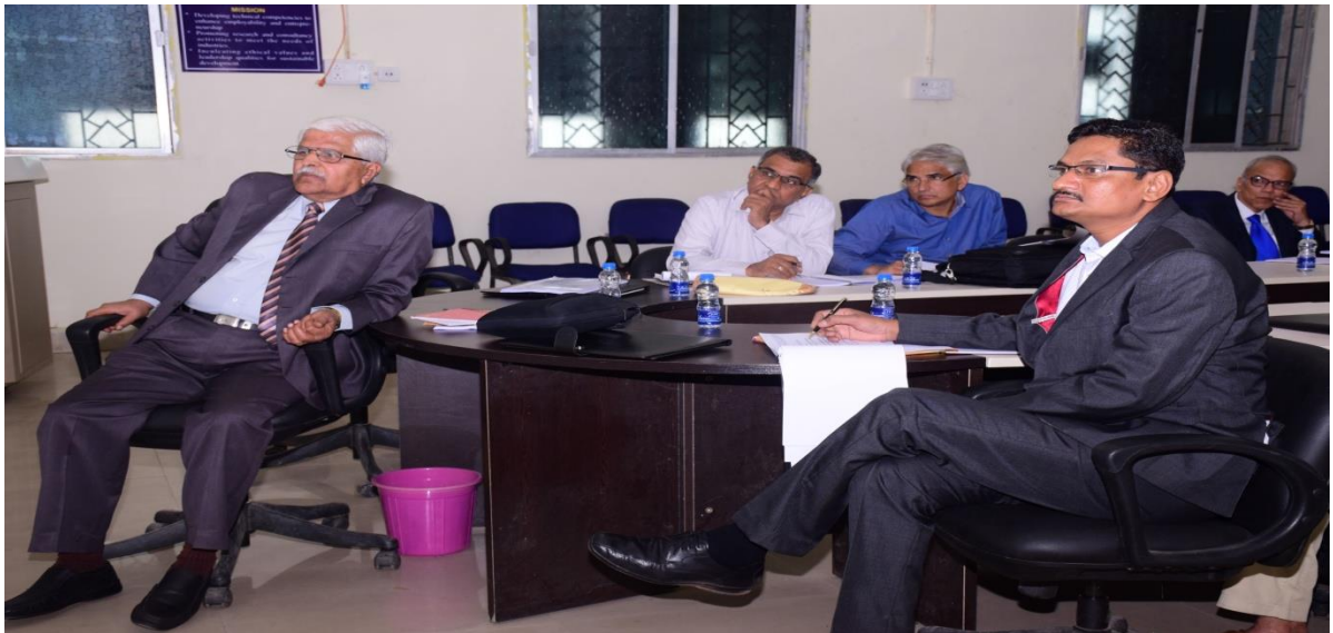
NBA Chairman & experts of Civil & Mechanical Engineering Program

The NBA Evaluation team visits have been fixed on 13-14-15 September 2019. Institute has carried out at least 3 mock evaluations of these programs, and it is hopeful to get it in all 3 programs