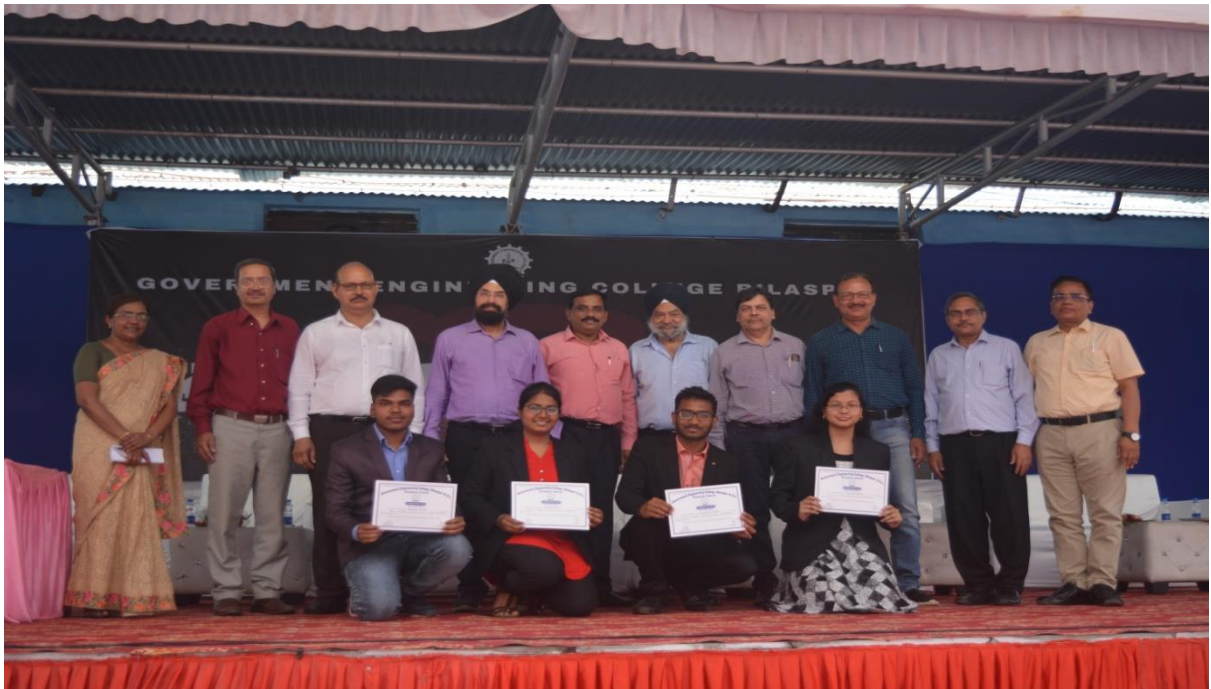
Certificate distribution to toppers