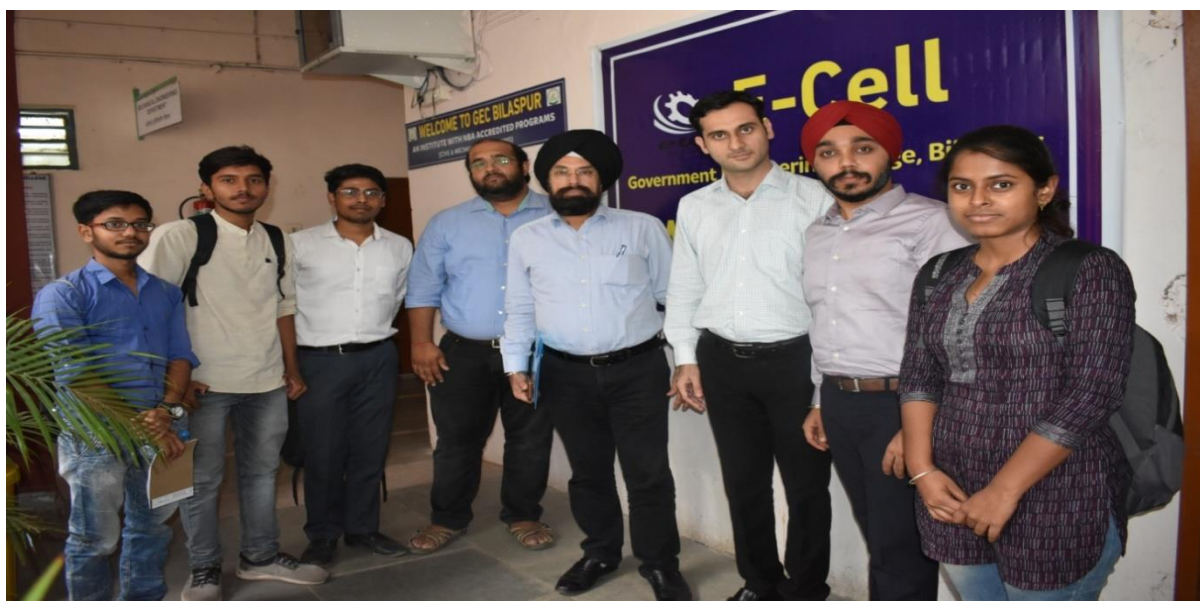
Team of “AAHAR” Start-up