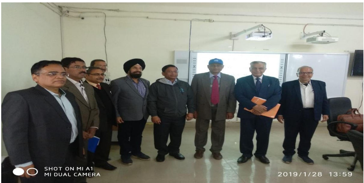
Member of Board of Governors