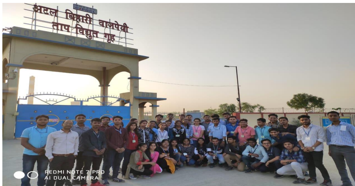
Industrial visit of 6 sem. Mechanical Students to Madwa