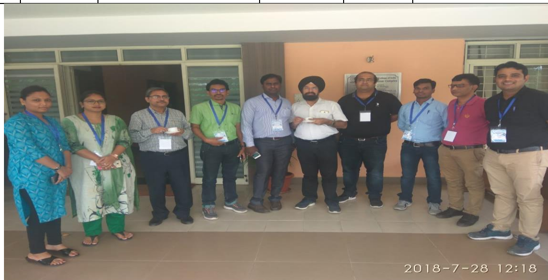
Start up conclave, ESCI Hyderabad, 27-29 July 2018