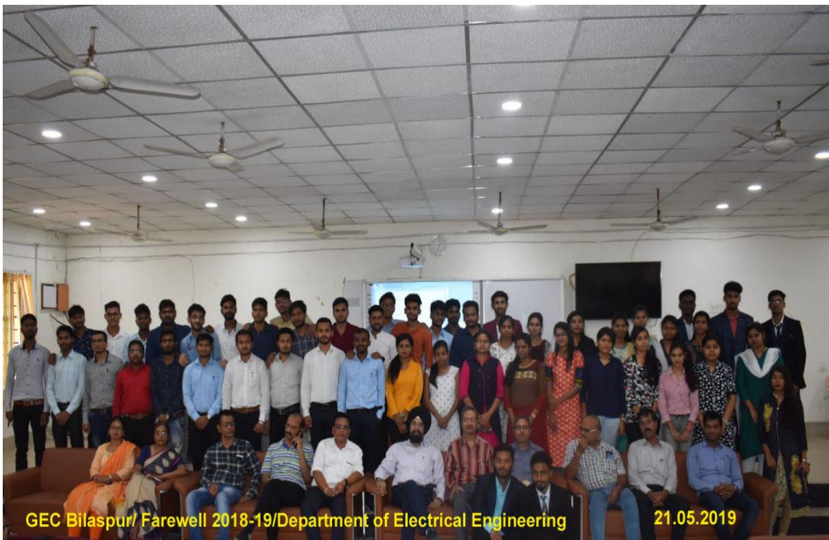
Farewell of 8th sem. Electrical Engg. Students