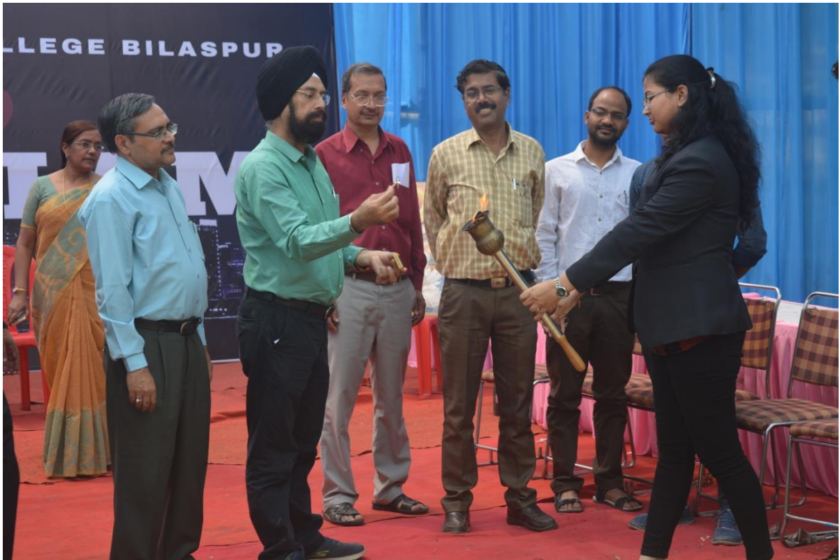
Opening ceremony of Kaushalam 2019