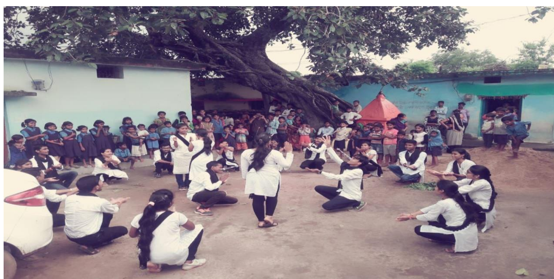
Nukkad natak by NSS on Dengue awareness in Kachhar village