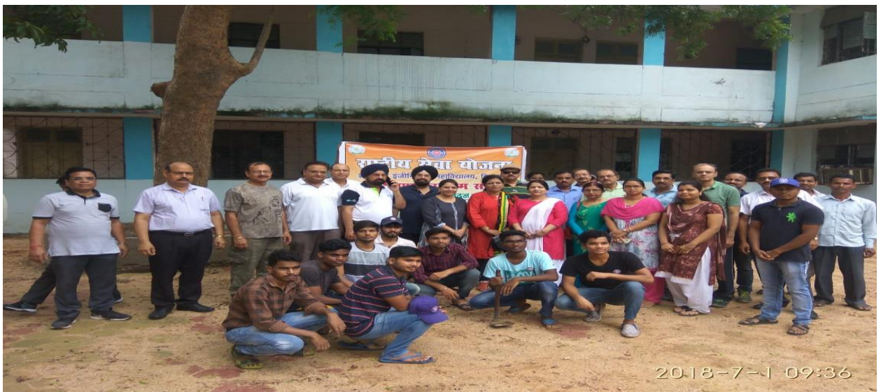
Plantation in campus