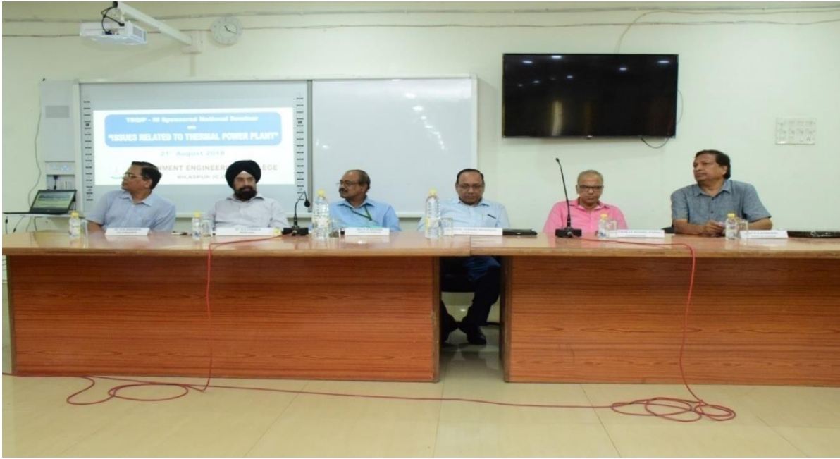
Inauguration of National Seminar on “Issues related to Thermal Power Plants”(20-8-2018)