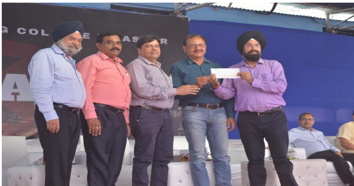
Cheque handed over from ABGEC to Principal, GEC Bilaspur to award overall Topper student