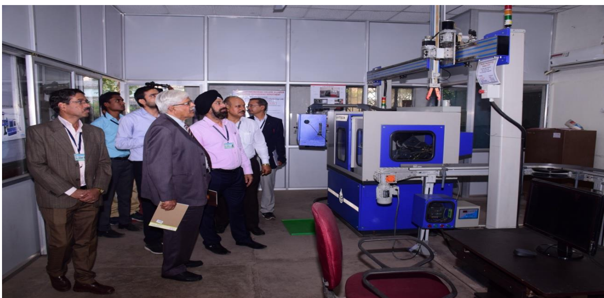
Chairman NBA team inspecting FMS